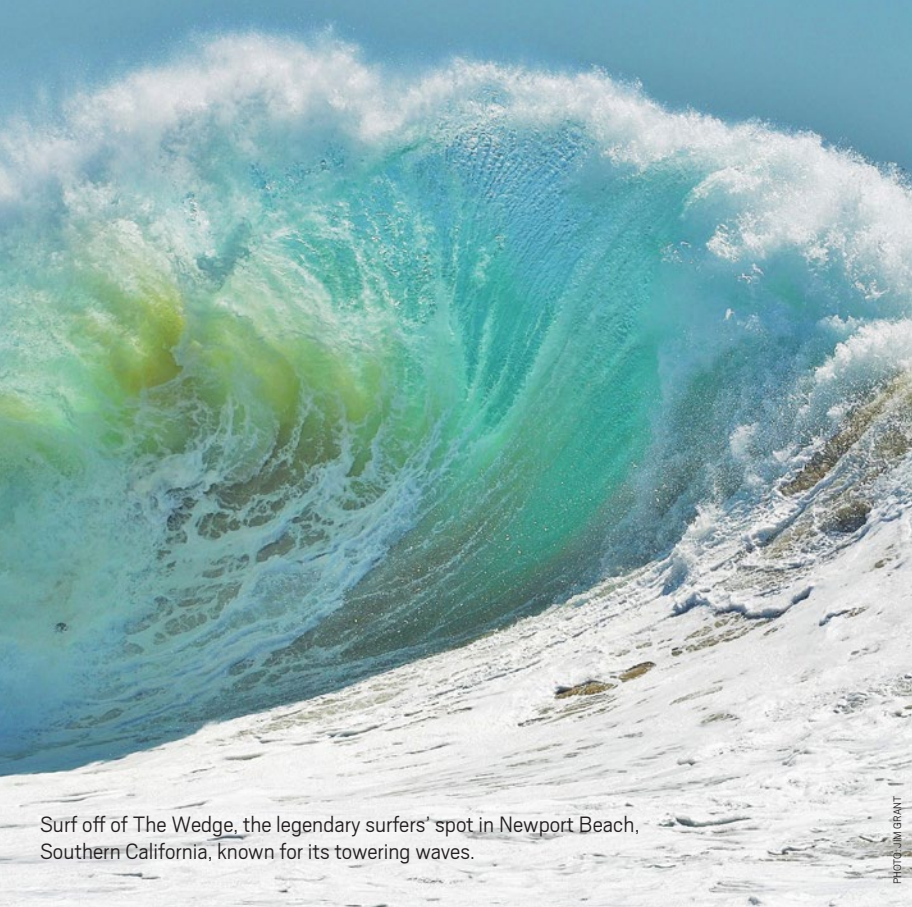
Surf off of The Wedge, the legendary surfers' spot in Newport Beach, Southern California, known for its towering waves.