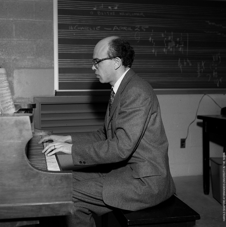
HAROLD SHAPERO AT BRANDEIS UNIVERSITY IN THE 1950S